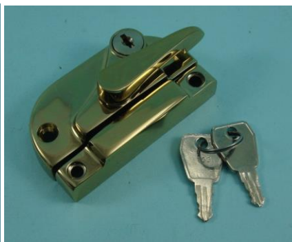
11mm Keep as fitted to the Fastener