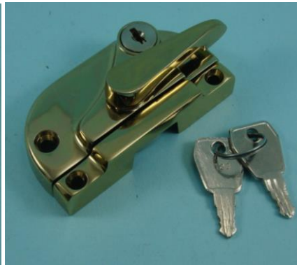
9mm Keep as fitted to the Fastener